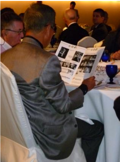
◀ Another happy reader, checking up on our latest news...