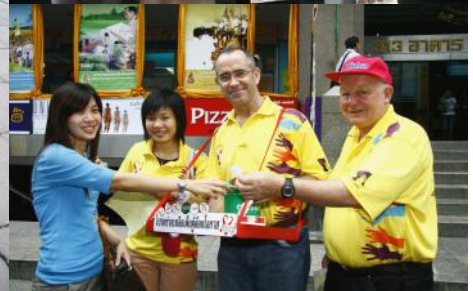
A small photo collection celebrating the many reasons Coins on Silom has always been a great success.