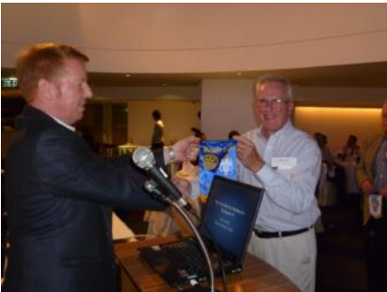
Not one, but two banners...