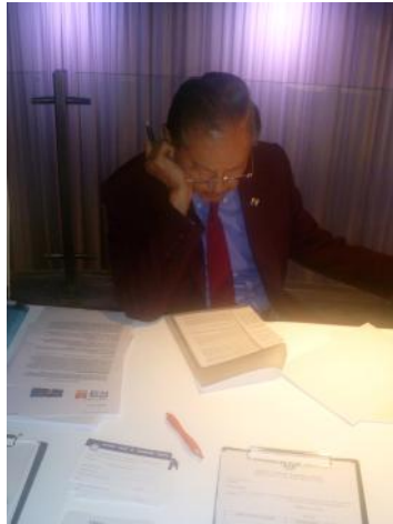
◀ Final preparation for another chapter in the annals of Rotary Information...