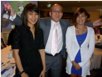
This week's lucky winner showing various stages of excitement concerning his winnings...