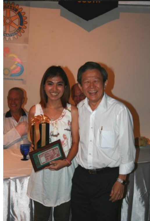
▶ PP Krit walks away with the bottle which is great news as the 50th Anniversary Party now has whiskey along with beer and wine...