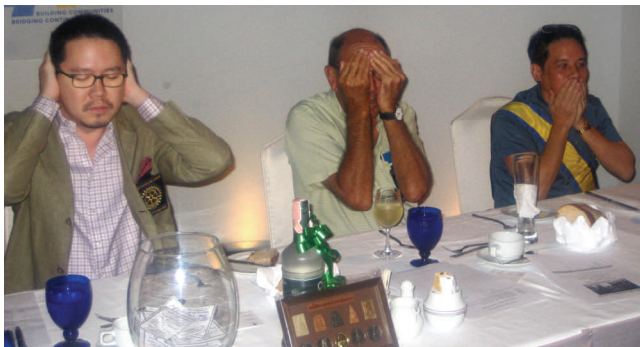
When the cat's away...