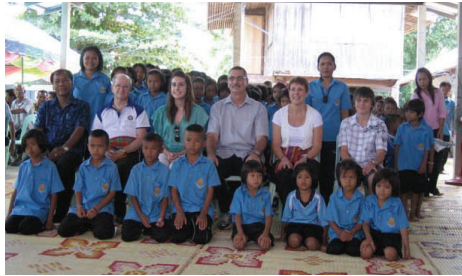
Students and teachers of Ban Takut Tarsar (headmaster far left)