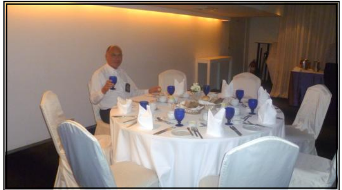
Accountants have all the fun...