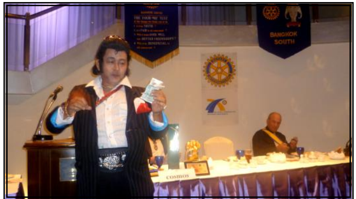
Elvis is alive an doing magic in Bangkok...