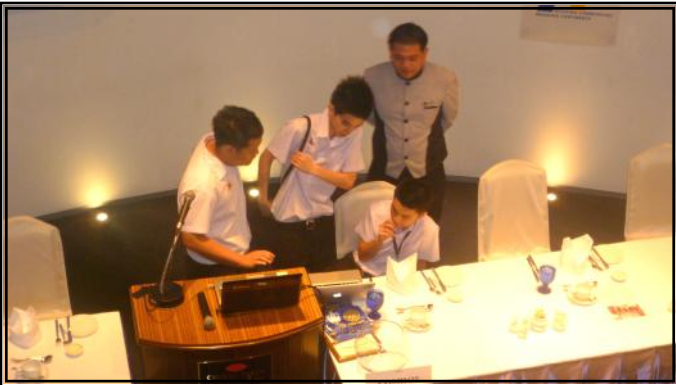
BCC Interators getting ready for their talk...