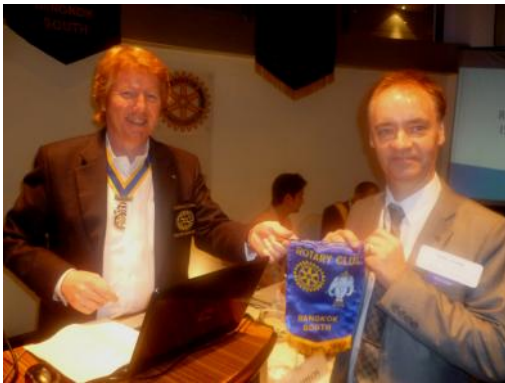
◀ Banner exchanges continue to keep our meetings grounded in Rotary...

He is Immediate Past President of the Rotary Club of Currie Balerno in Edinburgh and moved to Thailand In January this year.