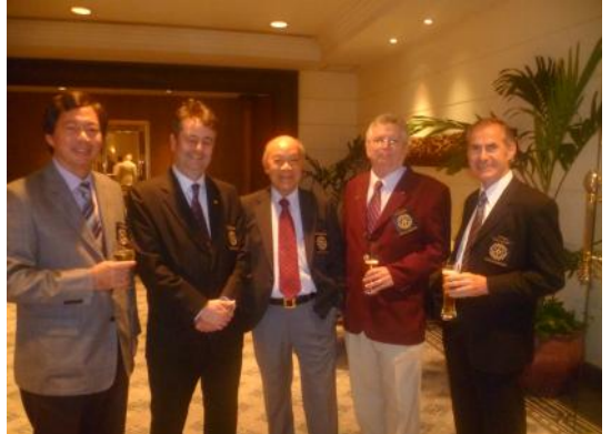
▶ The only five guys wearing a tie and jacket...