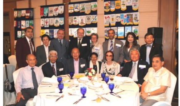
▶ Rotary Club of Bangkok in full force...