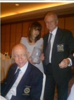
◀ PP Don making the Cosmos Rounds to the tune of 4,400 Baht...