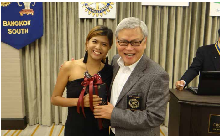
Winner of whisky