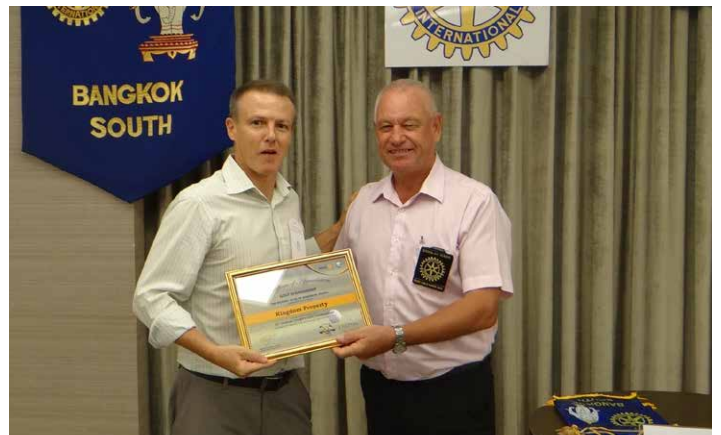
Presentation of Golf certificate to Kingdom Property