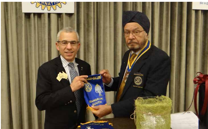
Presenting Bangkok South banner