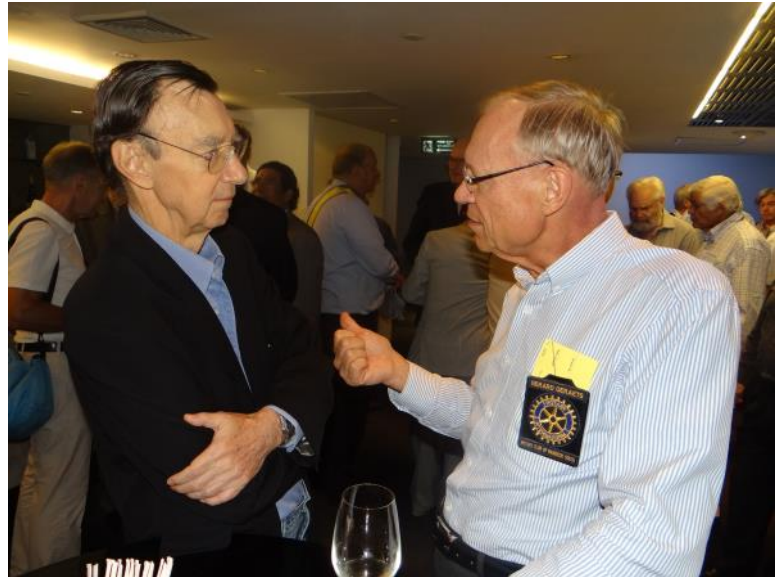
Serious discussions going on this week