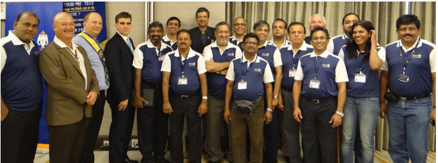
Colombo East were in town and came to visit us in numbers. A great group of visitors, they helped to enliven our weekly meeting with their warm smiles and joy at being able to share lunch with fellow Rotarians.