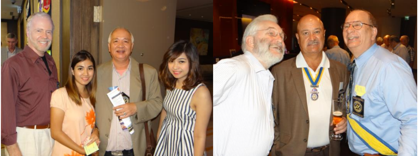
Ask people to smile and this is what you get... the good, the bad and the ugly...