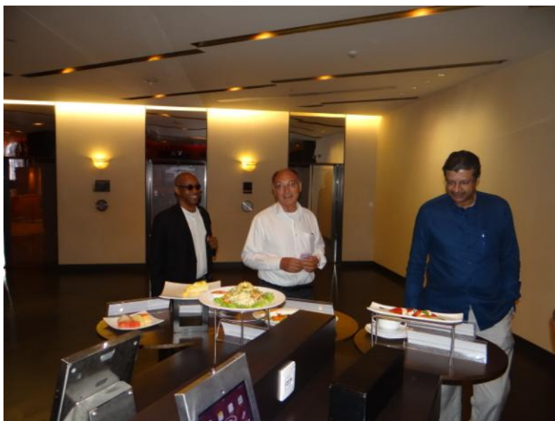
Wander in, browse the menu 'Japanese' style and enjoy some fellowship...