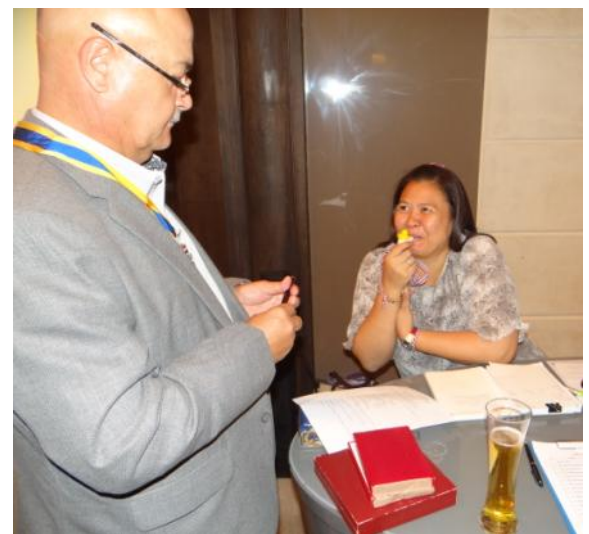
Should use this picture for a "Caption this Picture" Contest.