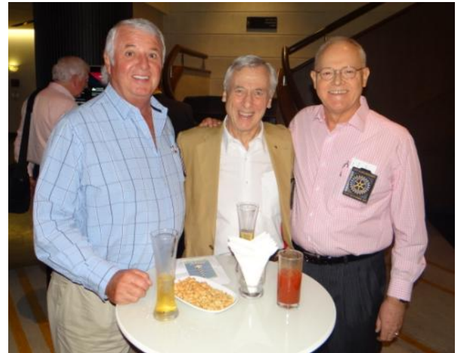
Drinks, cashew nuts and fellowship... what better way to start the weekend?