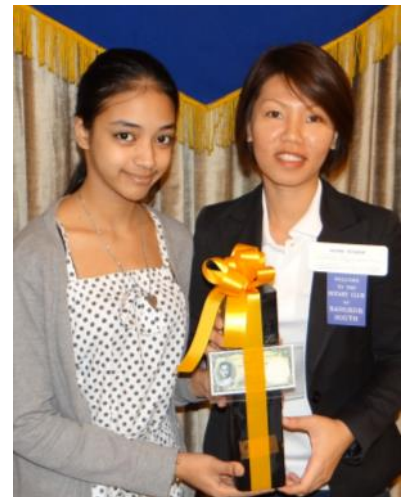
Our Lucky Visitor...

For Bangkok South Events rotarybangkoksouth.org/ calendar-of-events