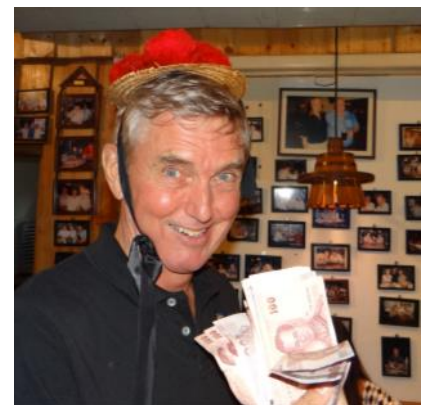
Das Madchen des Cosmos