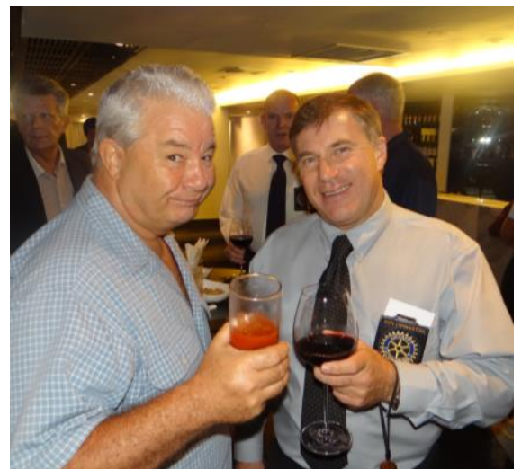
Grumpy and Happy...

rotarybangkoksouth.org/ calendar-of-events