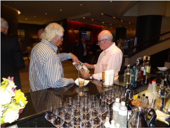
A South Wind Reader!