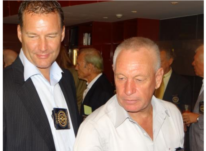
Something interesting down there