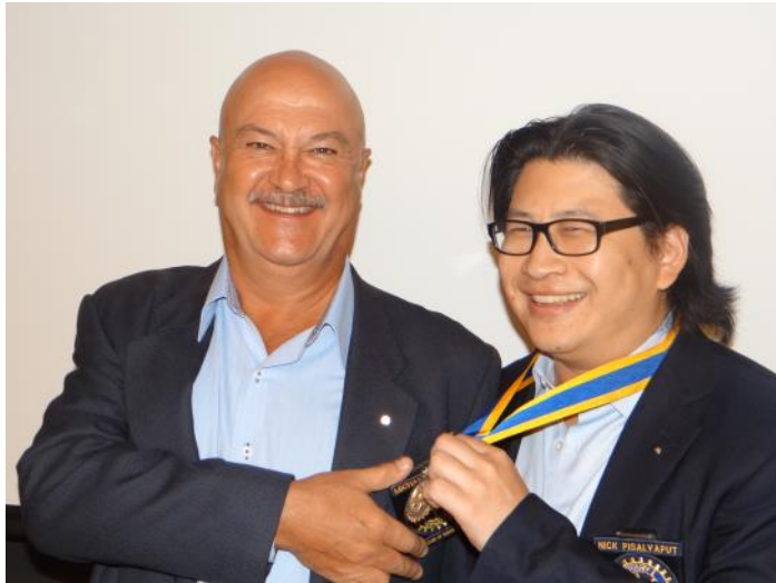
All smiles before the big handover...