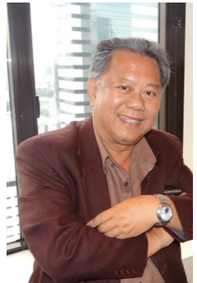
VP Ken looking happy the year is almost over..