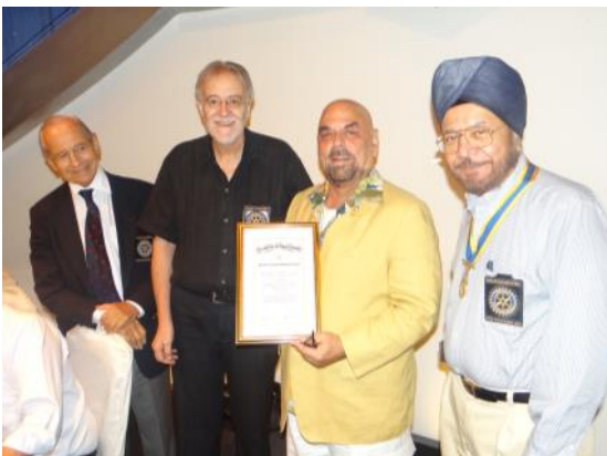
Penultimate shot of the day...