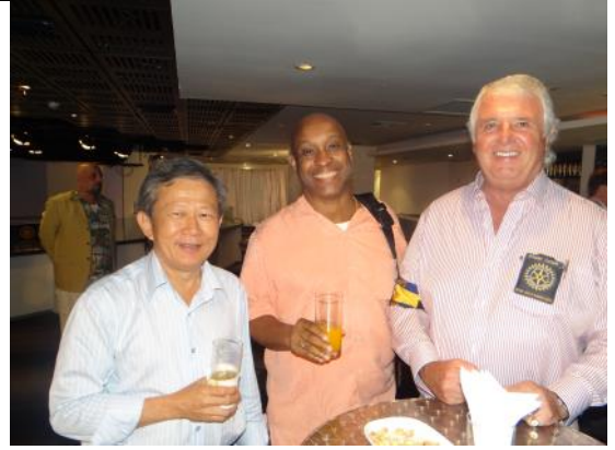
Drinks for almost everyone...