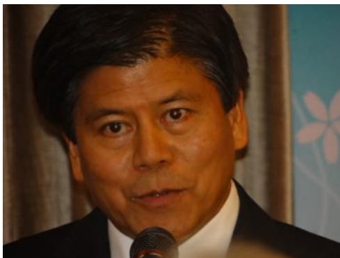
Dr Kantathi Suphamongkhon served as Foreign Minister during the administration of Prime Minister Thaksin Shinawatra. He is now a Senior Fellow at the Burkle Center for International Relations and teaches law & diplomacy at UCLA.

P rofessor Kantathi took the club on a historical adventure stretching back over a century to begin his informative narrative about the Preah Vihear Dispute, its past, present and future.