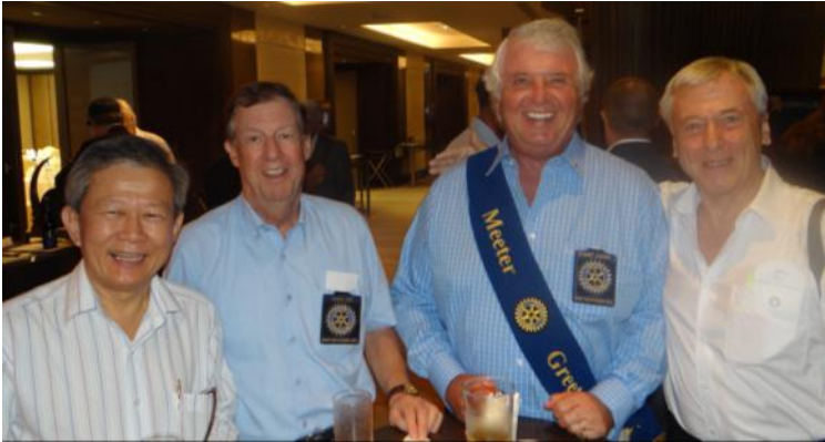
Lots of meeting and greeting by our Meeter and Greeter and our Meetees and Greetees....