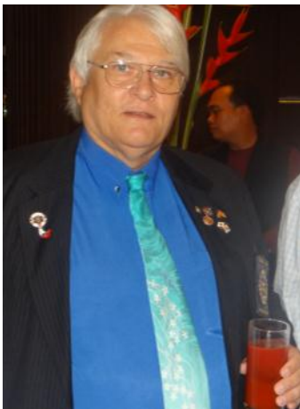
Tomato juice supplies still not a concern