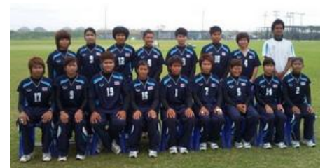
Thai Women's Cricket Team

He also went on to talk about cricket's long history overseas, including 258 years ago in Yokohama, America via the English colonies in the 17th century; West Indies by colonists and to India by British East India Company mariners in the first half of the century.